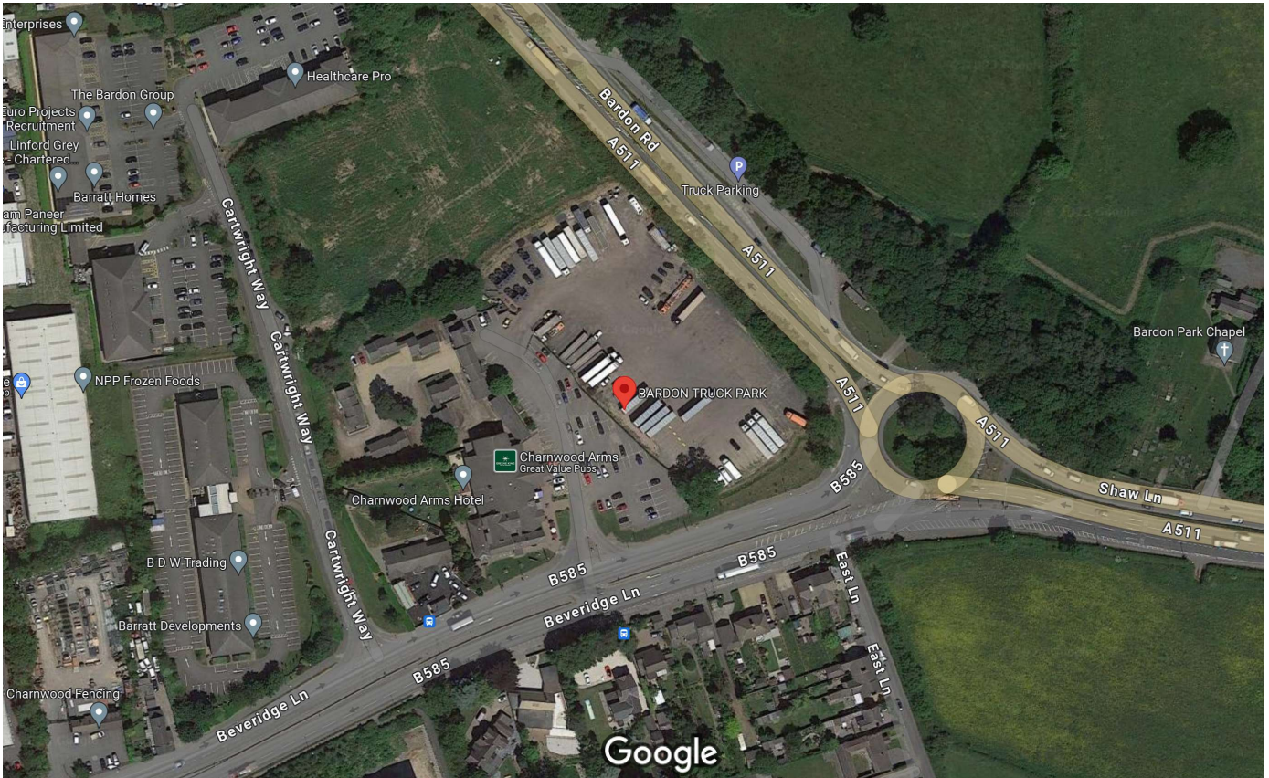
20 m